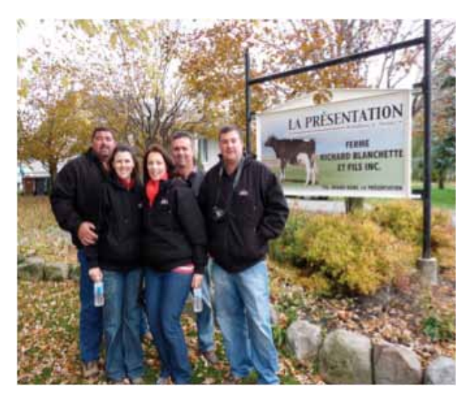
During our 3 day stay in Toronto, we attended the Semex International Gala dinner together with 800 other international guests from 75 different countries, the Redand-White Holstein show (98 animals on show), the Sale of Stars auction and the National Holstein Show (387 animals on show). The Grand Champion of the National Holstein show was Eastside Lewisdale Gold Missy, the Res. Grand was RF Goldwyn Hailey and the Hon. Mention was Stone-Front Iron Pasta. What a show to attend and watched by 7000 spectators!